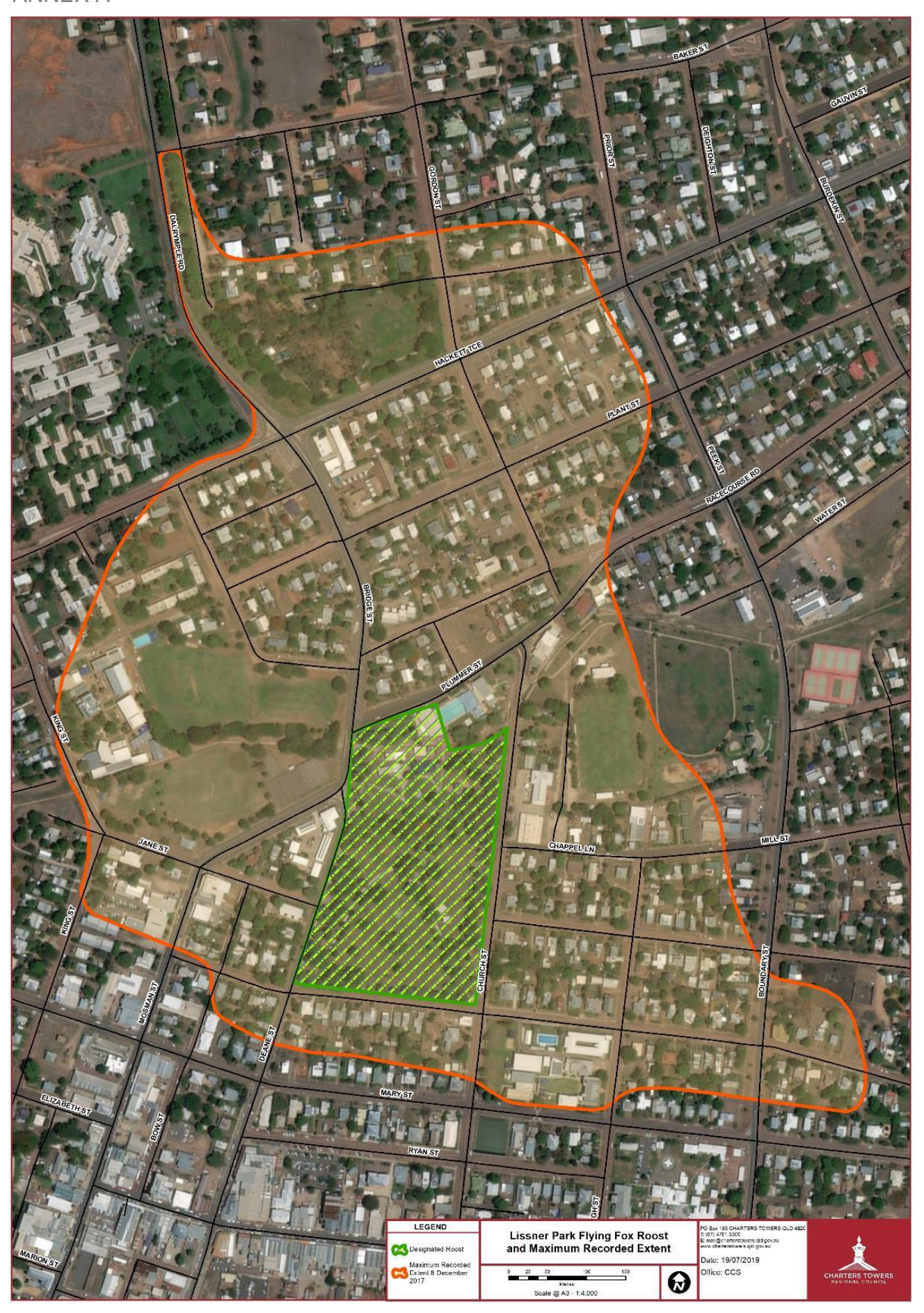
Flying Fox Statement of Management Intent